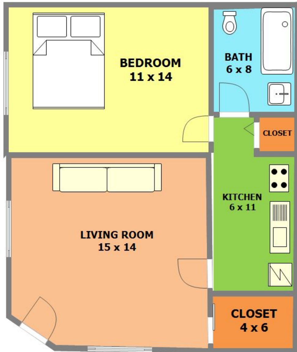
700 East 4th Street - Apt A

Here is an example of a floor plan that we can do for one of our clients: